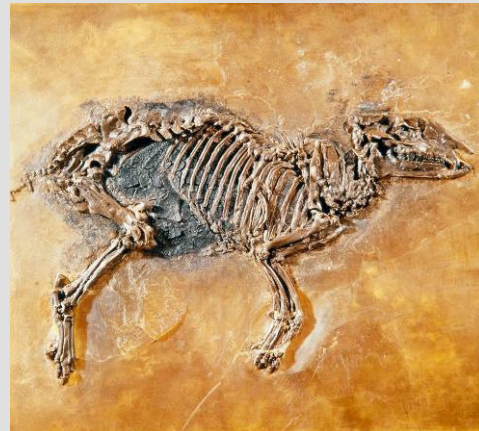
Primeval horse found in Messel

Messel – Messel Pit is the richest site in the world for understanding the living environment of the Eocene, between 57 million and 36 million years ago. The oil shale of the lake that once existed here is full of secrets and hides a wealth of animal and plant fossils, some of which are excellently preserved, ranging from fully articulated skeletons to the contents of stomachs of animals of this period. It provides an insight into continental drift and the sedimentation of the Earth, how the oceans and land bridges were formed between the various land masses, the depth and extent of the biosphere, and the climate and lifecycles from this period.