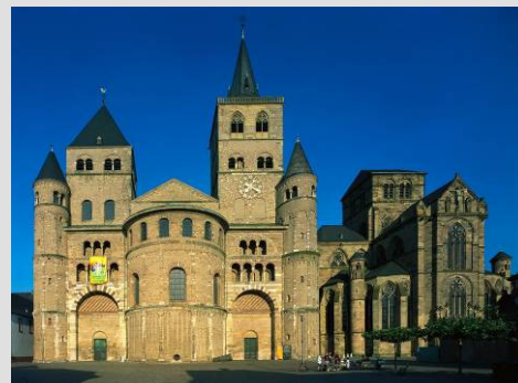
Cathedral and Church of Our Lady