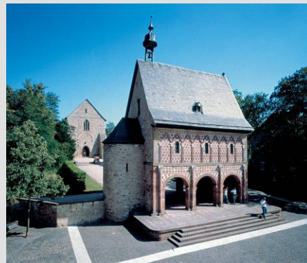
The Carolingian King's Hall

Lorsch – A lovely little town at the Bergstrasse (mountain road). In the Old Town visitors can find historic buildings, half-timbered houses and charming narrow lanes. The abbey, together with its monumental entrance, the famous King's Hall gate house, are rare architectural vestiges of the Carolingian era. The sculptures and paintings from this period are still in remarkably good condition.