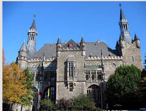
Historic Town Hall