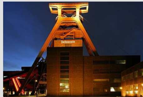
Zollverein colliery complex

Essen – European Capital of Culture 2010. Situated amidst the Ruhr area, a visit of this city is always worthwhile. Essen combines historic sites such as the Essen cathedral with sections of the Abbess Theophanu's medieval Ottonian basilica, and the cathedral treasury with one of Europe's most valuable collections of church treasures and precious religious objects from every epoch, with industrial landmarks like the Zollverein Colliery, part of the UNESCO World Heritage list. The complex consists of the complete infrastructure of a historical coal-mining site, with some 20th-century buildings of outstanding architectural merit. It constitutes remarkable material evidence of the evolution and decline of an essential industry over the past 150 years. Today it is used for cultural purposes.