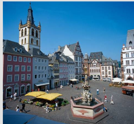
Main Market Square

Trier – The town's story begins around 16 B.C. when the Romans called it Augusta Treverorum , and it is proud of its two thousand year old heritage. It became one of the capitals of the Tetrarchy at the end of the 3rd century, when it was known as the 'second Rome'. Roman emperors, bishops, electors and prominent citizens all left their mark on the town by the Moselle river, as can be seen in Trier's magnificent art treasures and unique architectural monuments. The best known is the Porta Nigra, the massive Roman town gate (see front page ). The Roman monuments, outstanding testimony to Roman civilization, as well as the Cathedral of St. Peter and the Church of Our Lady have been designated UNESCO World Heritage sites in 1986.