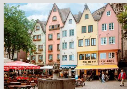
Medieval houses on Fischmarkt square