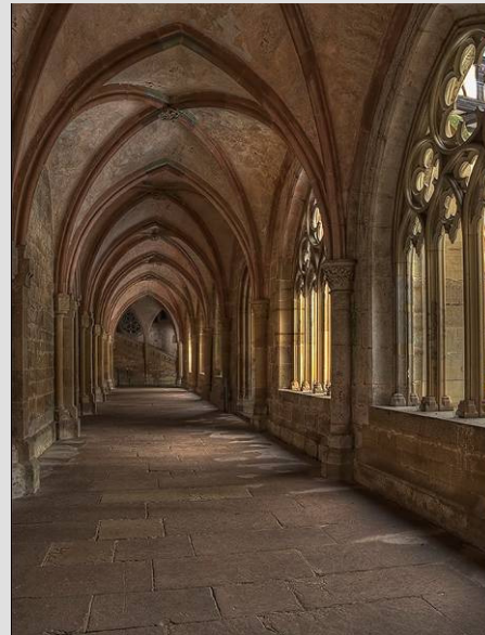
Inside the Monastery

Maulbronn – Situated on the fringes of the town, the Maulbronn Monastery was founded in 1147 by Cistercian monks. It is the most extensively preserved medieval monastic complex north of the Alps, and is shaped by an array of architectural styles from Romanesque to late-Gothic. The monastery offers a detailed insight into the life and work of the order from the 12th to the 16th century. Maulbronn's monks were renowned throughout the region for their agriculture. Fish were farmed in the grounds, a complex irrigation system was built, and almost all trades were practiced within the monastery walls. Cistercian monks lived, prayed and toiled in Maulbronn for 390 years.