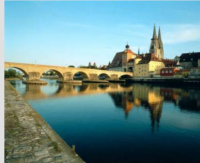
The Stone Bridge

Regensburg – Home to 2000 years of living history. Some of Europe's most important architectural and cultural monuments, plus fascinating museums and art collections make this an attractive destination. Situated on the banks of the Danube, Regensburg is the ideal base for boat trips along the river. The medieval town contains many buildings of exceptional quality that testify to its history as a trading centre and to its influence on the region from the 9th century. A notable number of historic structures span some two millennia and include ancient Roman, Romanesque and Gothic buildings. Regensburg's 11th- to 13th-century architecture – including the market, city hall and cathedral – still defines the character of the town marked by tall buildings, dark and narrow lanes, and strong fortifications. The buildings include medieval patrician houses and towers, a large number of churches and monastic ensembles as well as the 12th-century Old Bridge. The town is also remarkable for the vestiges testifying to its rich history as one of the centers of the Holy Roman Empire that turned to Protestantism.