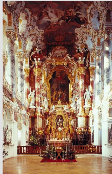
Inside the Wieskirche Church

Steingaden – A beautiful little town in the Bavarian Pfaffenwinkel region. Its Wieskirche Pilgrimage Church, a UNESCO world heritage site, is an unparalleled example of how light can be used as a building element alongside brick and stone. True pilgrims leave their cars in Steingaden and climb the shady path on foot, a walk that takes around an hour. The Church is sumptuously decorated and dedicated to the "Scourged Saviour". It is regarded as one of the most beautiful rococo churches in southern Germany. Between 1745 and 1754, Dominikus Zimmermann enlisted the help of a number of leading artists of the time to create this undisputed highlight of Bavarian rococo architecture. With its opulent stucco ornamentation and the ceiling fresco painted by his brother Johann Baptist, it is a masterpiece of human creativity.