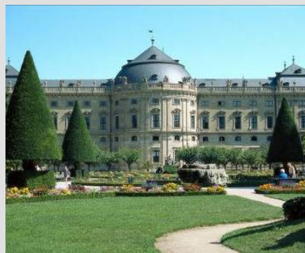
The Residence Palace

Würzburg – The capital of lower Franconia is one of the loveliest baroque cities in Germany and became famous as the center of Franconian wine production. It is a popular stop among tourists traveling the Romantic Road, beautifully embedded in the valley of the Main River and is surrounded by grapevine-covered hills. Interesting places to visit include the medieval fortress Marienberg, the historic town hall building and the Romanesque cathedral "St. Kilian." From the old bridge "Alte Mainbrücke", visitors enjoy fantastic views of the fortress "Marienberg" and the pilgrimage church "Käppele". The magnificent Baroque palace – one of the largest and most beautiful in Germany and surrounded by wonderful gardens – was created under the patronage of the prince-bishops Lothar Franz and Friedrich Carl von Schönborn. It was built and decorated in the 18th century by an international team of architects, painters, sculptors and stucco-workers, led by Balthasar Neumann. Since 1981 it is part of the