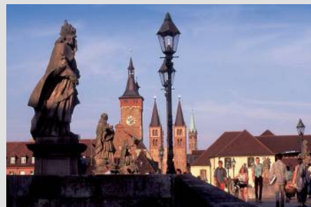
Main Bridge in the evening