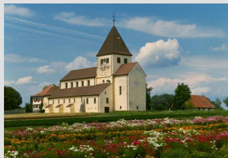
St. Georg Church

Reichenau Island – The monastic island in Lake Constance is an outstanding representation of the religious, intellectual and artistic influence exercised by powerful Benedictine abbeys in the early Middle Ages. It was founded in 724 AD by the itinerant bishop Pirmin. Built between the 9th and 11th centuries, the island's three Romanesque churches epitomize early medieval architecture. At the time of the Carolingians and Ottonians they were regarded as the intellectual outposts of the western world. The church wall paintings illustrate the island's importance as a centre of European art in the 10th and 11th centuries. Eminent scholars taught at the renowned abbey school, which produced outstanding theologians, politicians, scientists, poets and musicians. Other famed establishments included the abbey library, Reichenau art school and the goldsmiths.