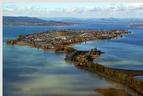
Reichenau Island in Lake Constance