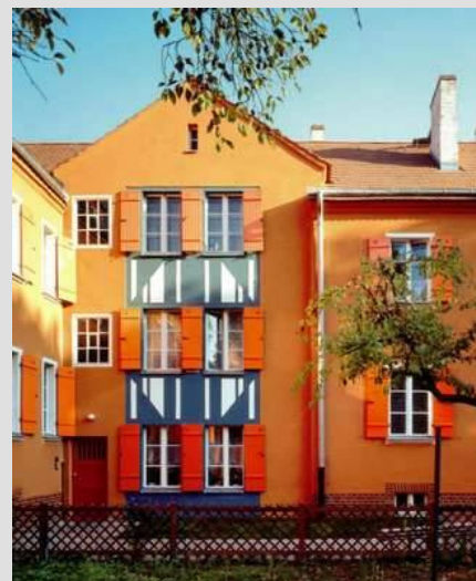
Modernism Housing Estates