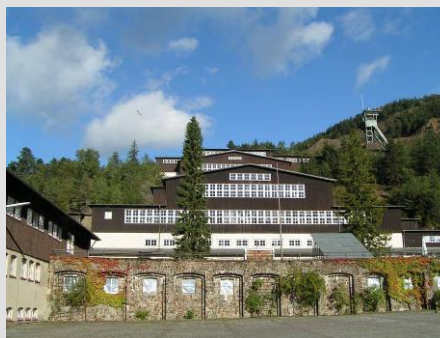
Rammelsberg Ore Mine Museum