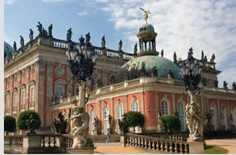
New Palace in Sanssouci Park

Potsdam – An island amidst the chain of lakes on the Havel and the beautiful wooded countryside that surrounds it. Idyllic lakes and rivers, combined with the fabulous palaces and gardens, make a visit to Potsdam and its surroundings an experience to remember. With 500 ha of parks and 150 buildings constructed between 1730 and 1916, Potsdam's complex of palaces and parks forms an artistic whole, whose eclectic nature reinforces its sense of uniqueness. Voltaire stayed at the Sanssouci Palace, built under Frederick II between 1745 and 1747.