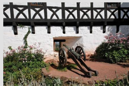
Canon inside the Castle