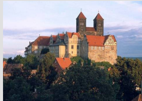
Castle with St. Servatius Church

Quedlinburg – an important royal and imperial town in the Middle Ages, and one of Germany's foremost heritage sites. Situated on the Romanesque Route for its St. Servatius Church in the Quedlinburg Castle (UNESCO site), it is a fine example of a beautifully preserved medieval town. Quedlinburg's historic layout boasts a wealth of art nouveau architecture and over 1,300 timber-framed houses from a period spanning eight centuries. The Collegiate Church of St. Servatius on Schlossberg hill can be seen for miles around. A wonderful example of Romanesque architecture, it houses a priceless collection of church treasures from the Middle Ages. The first German emperor Heinrich I and his wife Mathilde are both buried in the crypt.