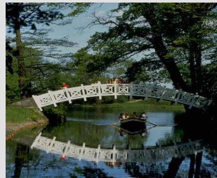
Gondola ride in Wörlitz Park

Wörlitz – The Garden Kingdom of Dessau-Wörlitz is an exceptional example of landscape design and planning of the Age of the Enlightenment, the 18th century, and has therefore been added to the UNESCO list in the year 2000. Its diverse components - outstanding buildings, landscaped parks and gardens in the English style, and subtly modified expanses of agricultural land - serve aesthetic, educational, and economic purposes in an exemplary manner.