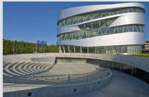
Mercedes Benz Museum

Dinner at the restaurant Stuttgarter Stäffle