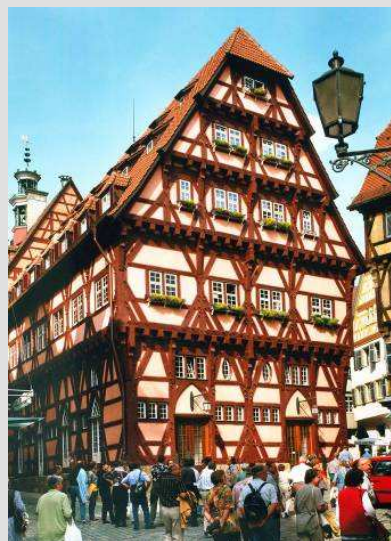
Old Town Hall

Esslingen – The former Free Imperial City of Esslingen am Neckar nestles in the Neckar Valley and is surrounded by vineyards. The city looks back on a history of over 1,200 years. A stroll through the winding cobblestone alleyways and inviting pedestrian zones of the historical Old Town can be recommended not only as a shopping experience but also as a walk into the past. The medieval Old Town is the only one in the Stuttgart Region to be so well preserved. The oldest row of half-timbered houses in Germany can be admired as well as patricians' and wine-growers' houses, churches, monastic administrative centers (Pflegehöfe), gate towers and towers.