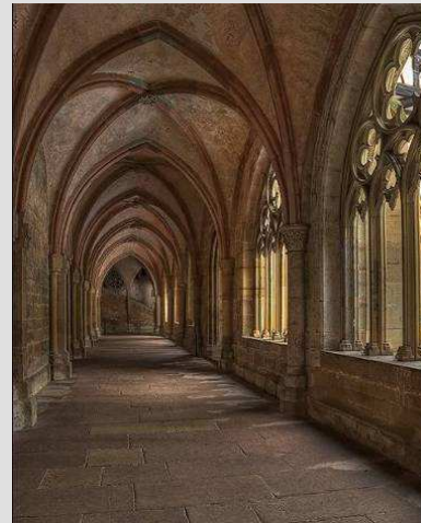
Inside the Monastery

Maulbronn – Situated on the fringes of the town, the Maulbronn Monastery was founded in 1147 by Cistercian monks. It is the most extensively preserved medieval monastic complex north of the Alps, and is shaped by an array of architectural styles from Romanesque to late-Gothic. The monastery, a UNESCO World Heritage site, offers a detailed insight into the life and work of the order from the 12th to the 16th century. Maulbronn's monks were renowned throughout the region for their agriculture. Fish were farmed in the grounds, a complex irrigation system was built, and almost all trades were practiced within the monastery walls. Cistercian monks lived, prayed and toiled in Maulbronn for 390 years.