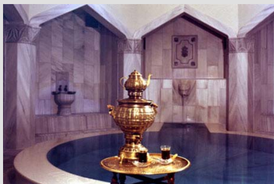
'Hamam' – Turkish bath at the Wohlfühltherme

Bad Griesbach – Part of the spa town triangle in eastern Bavaria. Apart from its thermal water spa facilities at the Wohlfühltherme (“wellbeing spa”) the town is particularly known for its expansive golf resort – the biggest in Europe, including the world’s largest golf school.