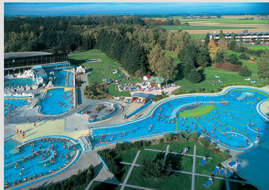
Outdoor pools at Johannesbad spa

Bad Füssing – Europe's most popular health resort located right in the heart of Bavaria's spa land. The town awaits its visitors with a unique combination of Bavarian hospitality, wellness and state-of-the-art medical expertise. Bad Füssing's Johannesbad thermal spa is one of the biggest in Europe and offers a constant flow of natural thermal mineral water from the spa's own source 0.66 miles below the earth into 13 different pools with graduated water temperatures from 82°F- 100°F.