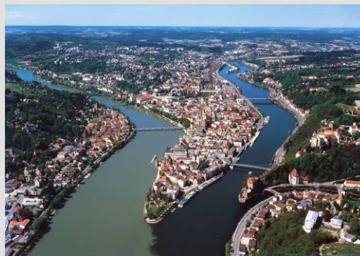
Confluence of the three rivers: The blue Danube, the green Inn and the black Ilz

Passau – located in the southeast of Germany at the Austrian border. Situated at the confluence of the rivers Danube, Inn and Ilz, Passau is worldwide known as "The Three Rivers City". The earliest evidence of human settlement dates back to the Neolithic period. Passau was part of the Roman Empire for more than 400 years. It became an Episcopal seat in the year 739 AD. Passau was an independent prince bishopric for over 600 years. Finally in 1803 Passau was annexed into Bavaria. The setting of the Old Town, created by Italian baroque masters in the 17th century, shows soaring towers, picturesque places, enchanting promenades and romantic lanes. Passau is the most Southern stop on the Bavarian Glass Road.