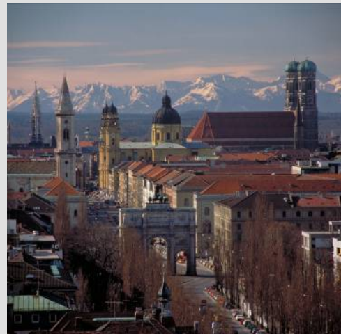
Aerial view of Munich

Munich – the capital of Bavaria has a lot of attractions to offer for all ages and tastes. Whether you are interested in history, architecture or art; whether you enjoy strolling through the parks, fancy attractions like a trip to the Bavaria Film Studios or long for a visit to one of Munich's famous traditional beer gardens, you will always find something exciting in this multi-faceted city. Munich is also home to 46 museums, 56 theaters, 2 opera houses, and of course the world famous Oktoberfest which attracts millions of visitors from all over the world each year. Take a romantic stroll through the old parts of the city around Marien Square, Viktualien Market and Odeon Square, enjoy a walk along the Isar river and its beautiful embankments, or visit the magnificent Nymphenburg Palace.