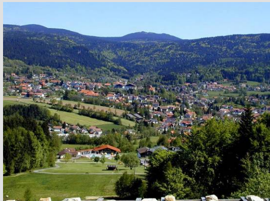
Aerial view of Bodenmais

Bodenmais – Beautifully set in the Mountains of the Bavarian Forest, this town is the headquarter of Joska, the world's #1 producing company of glass/crystal trophies and awards for high class sporting events. With the "Waldglashuette" (glass factory) in town and particularly the great Crystal Experience exhibition, Joska connects to the town's historic roots of producing and processing glass in the Bavarian Forest. In the exhibition visitors can watch the glass artists, polishers and engravers working in the factory, see a glass-blowing demonstration, or even try it for themselves.