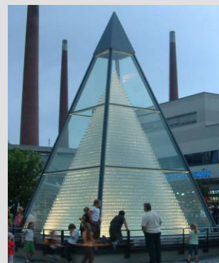
Pyramid of crystal glasses

Zwiesel – With around 15 glassworks, workshops and galleries, Zwiesel is the centre of glassmaking and processing in the Bavarian Forest. The Technical College for Glass, Zwiesel Kristallglas, Ambiente, Rimpler and the Theresienthal crystal factory are just a few of the names associated with glassmaking in this town. Since 2007 Zwiesel is home to the world's highest crystal glass pyramid: 27 ft. tall and made out of 93,000 crystal glasses.