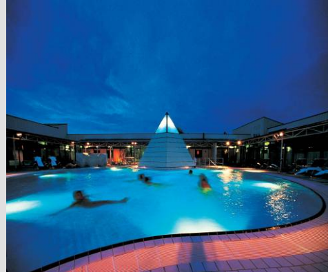
Rottal Spa at night

Bad Birnbach – This eastern Bavarian town started its path to becoming a spa town in 1973 when drilling resulted in the discovery of thermal water with healing powers. Today the water can be enjoyed at the Rottal Spa with its 12 indoor and outdoor pools. Naturally warm water temperatures are consistent at approximately 100°F allowing visits all year round. Bad Birnbach also offers an 18-hole golf course starting in the town and ending up on the hills with beautiful views of the surrounding Rottal Hills.