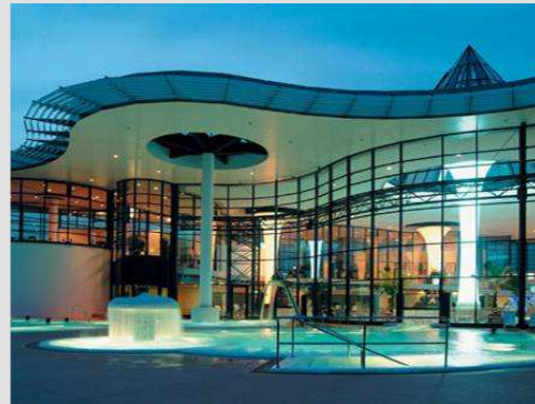
KissSalis Thermal Spa

Bad Kissingen – Since the beginning of the 19th century, people have been coming to Bad Kissingen to enjoy the therapeutic effects of mud as well as water. Alongside the thermal mineral waters, Bad Kissingen is also famous for its natural mud treatments containing valuable biological ingredients. Heated to 104°F, the mud gradually spreads pleasant warmth all over your body. The treatment even reaches inner organs and muscles, making mud spas and packs particularly good for rheumatic diseases, joint complaints and hormonal disorders, as well as for relieving the general symptoms of stress. Mud treatments can also help alleviate the other medical conditions such as cardiovascular disease, musculo-skeletal illnesses, rheumatic diseases and diseases of the digestive system.