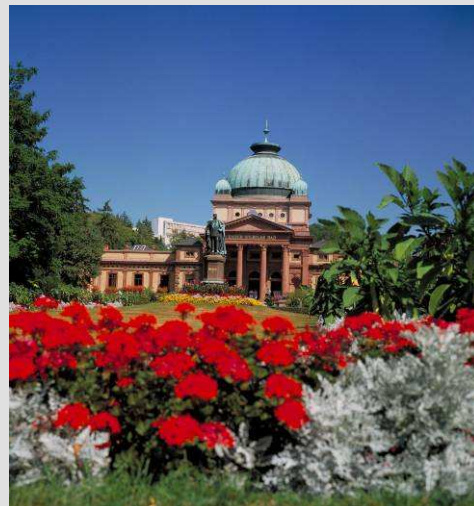
Kaiser Wilhelm Spa

Bad Homburg – It wasn't so long ago that princes and kings from all over the world flocked to Bad Homburg to relax, recuperate and revitalise themselves. This idyllic spa resort at the foot of the Taunus hills, its "champagne air" and the exclusive surroundings of the casino and spa gardens, were lauded by none other than Kaiser Wilhelm II. Today, guests can unwind in regal luxury at the Kur Royal Day Spa in the Kaiser Wilhelm Spa. Formerly the residence of the Landgraves of Hessen-Homburg, it is among the finest baroque complexes in Germany, and rose to international fame after featuring in Heinrich von Kleist's "Prince of Homburg" play. The town's health treatments are focused on the salubrious, therapeutic powers of the high-quality thermal waters, which are full of beneficial mineral elements.