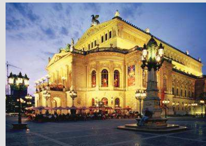
Alte Oper concert hall