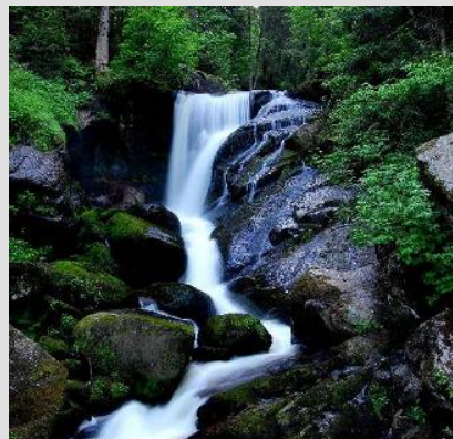
Waterfalls in the Black Forest

Black Forest – Deeply rooted in its traditional culture and possibly best known as the home of the cuckoo clock, the Black Forest is an area of mountains and forest 125 miles long and up to 40 miles wide, which borders France in the west and Switzerland in the south. Many luxurious spa resorts use the hot or mineral springs in the valleys for a variety of therapeutic treatments.