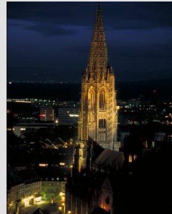
Minster at night

Freiburg – The minster is Freiburg's most famous landmark. Münsterplatz - minster square - is the focal point and the heart of the town. Freiburg's picturesque old quarter is grouped around Münsterplatz. The open streams - known as "Bächle"- which flow through the streets and lanes add to the charm. Also on Münsterplatz is the Historical Merchants' House, which was built as a customs house and warehouse. In the summer months, Freiburg hosts a local wine festival.