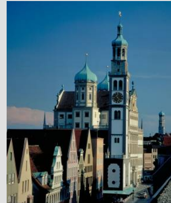
City hall and Perlach Tower

Augsburg – The Romans founded Augsburg in 15 BC, making it the oldest town in Bavaria. The city lies between the rivers Lech and Wertach and is named after its founder, Emperor Augustus. Two Patrician families - the Fuggers and the Welsers - transformed Augsburg into a rich and influential town through their banking and trading activities. The center of this charming city is the magnificent ensemble of the Renaissance Town Hall and the Perlach Tower. Augsburg also is home of St. Anne's Church, the St. Ulrich Churches - one catholic and one protestant - and the romanesque gothic St. Mary Cathedral.