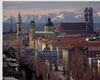
Aerial view of Munich

Munich – the capital of Bavaria has a lot of attractions to offer for all ages and tastes. Whether you are interested in history, architecture or art; whether you enjoy strolling through the parks, fancy attractions like a trip to the Bavaria Film Studios or long for a visit to one of Munich's famous traditional beer gardens, you'll always find something exciting in this multi-faceted city. Munich is also home to 46 museums, 56 theaters, 2 opera houses, and of course the world famous Oktoberfest which attracts millions of visitors from all over the world each year. Take a romantic stroll through the old parts of the city around Marien Square, Viktualien Market and Odeon Square to see how Munich's past is still lived in the every day life, enjoy a walk along the Isar river and its beautiful embankments, or visit the magnificent Nymphenburg Palace.