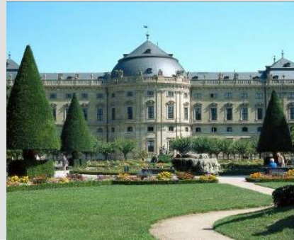
The Residence Palace

Würzburg – The capital of lower Franconia is one of the loveliest baroque cities in Germany and became famous as the center of Franconian wine production. It is a popular stop among tourists traveling the Romantic Road, beautifully embedded in the valley of the Main River and is surrounded by grapevine-covered hills. Interesting places to visit include the UNESCO World Heritage Site the Residence Palace, the medieval fortress Marienberg, the historic town hall building and the Romanesque cathedral "St. Kilian." From the old bridge "Alte Mainbrücke", you will enjoy fantastic views of the fortress "Marienberg" and the pilgrimage church "Käppele".