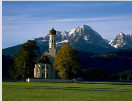
Church St. Coloman

Füssen – On the banks of the turquoise river Lech, the old town center is a maze of narrow medieval streets and magnificent baroque churches. Grouped around it are the villages of Bad Faulenbach, Hopfen am See and Weissensee, all set in idyllic lakeland scenery amid the foothills of the Alps. Füssen is Bavaria's town at the highest elevation, and the ideal starting point for visiting the royal castles of Neuschwanstein and Hohenschwangau.