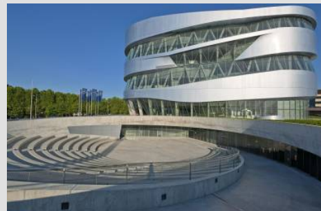
Mercedes Benz Museum