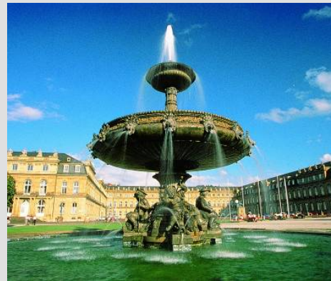
New Palace Square

Stuttgart – Charmingly situated in the heart of one of Germany's largest wine-growing regions, this vibrant metropolis fascinates visitors from all over the world. The state capital of Baden-Wuerttemberg delights tourists not only by virtue of its magnificent panorama, its impressive gardens and parks, its fine squares, splendid palaces and buildings in a wide range of architectural styles, but also by its cultural diversity. Visit the medieval Old Palace - with its cloistered courtyard, the palace reflects the splendor of the former ducal town. Just around the corner, the magnificent baroque building of the New Palace and its square are in the heart of the city and popular meeting places. Also a big draw for visitors is the sensational Mercedes-Benz World as well as the Porsche-Museum.