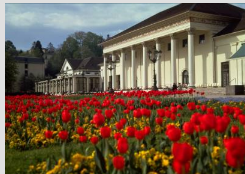
The Baden-Baden Spa park

Baden-Baden – is well-established as Germany's chic spa resort at the foot of the Black Forest. Its cosmopolitan flair and degree of sophistication are rare for a town of this size. With its glorious parks and beautiful gardens, Baden-Baden is a paradise for people who appreciate the finer things in life and are looking for a relaxing break. Culinary Connoisseurs might want to visit the Rebland, Baden-Baden's winegrowing country which produces fabulous Rieslings. There are also numerous restaurants serving the finest Badensian cuisine.