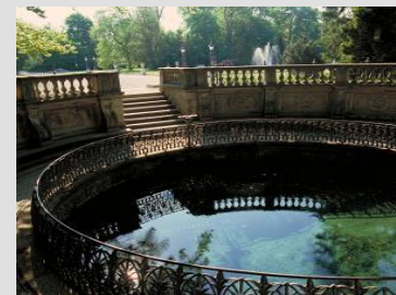
Source of the Danube

Donaueschingen – Travelers who are appreciative of culture and nature can look forward to an unforgettable holiday experience along the Danube ('Donau'). Visitors will have the chance to see its charming art nouveau architecture as well as the river's very source in the beautiful Fürstenberg Palace Park. The young Danube between Donaueschingen and Ulm is a true wonder child and particularly suitable for cycling tours and boat trips.