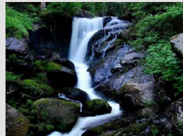
Waterfalls in the Black Forest

Black Forest – Deeply rooted in its traditional culture and possibly best known as the home of the cuckoo clock, the Black Forest is an area of mountains and forest 125 miles long and up to 40 miles wide, which borders France in the west and Switzerland in the south. Many luxurious spa resorts use the hot or mineral springs in the valleys for a variety of therapeutic treatments.