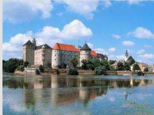
Castle and St. Mary's town church

Torgau – the City of Renaissance and Reformation. In Torgau the first Protestant church was established in 1544. Here the Torgau Articles were drawn up, and essential part of the Augsburg Confession. Martin Luther's wife is buried at the Church of St. Mary.