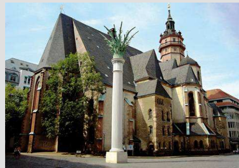
St. Nicholas Church