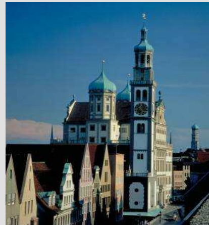
City hall and Perlach Tower

Augsburg – The Romans founded Augsburg in 15 BC, making it the oldest town in Bavaria. The city lies between the rivers Lech and Wertach and is named after its founder, Emperor Augustus. Two Patrician families - the Fuggers and the Welsers - transformed Augsburg into a rich and influential town through their banking and trading activities. The center of this charming city is the magnificent ensemble of the Renaissance Town Hall and the Perlach Tower. Augsburg is home of St. Anne's Church with Lutherhoefle and the Lutherstiege museums, the St. Ulrich Churches - one catholic and one protestant - and the Romanesque gothic St. Mary Cathedral.