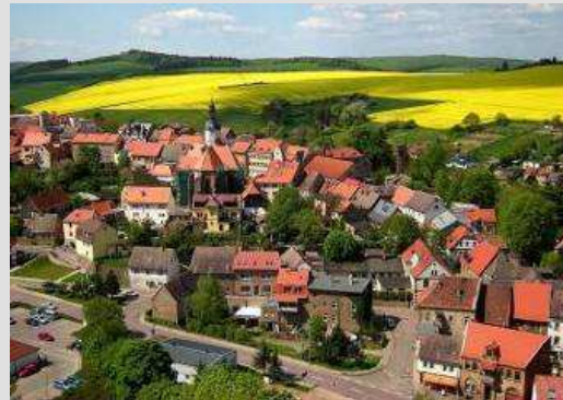
View from the castle

Mansfeld – Luther spent his childhood in Mansfeld which was the centre of the copper-mining industry. Mansfeld has a famous Luther memorial and it commemorates the reformer's childhood. The Mansfeld Castle is set on a hill overlooking the town.