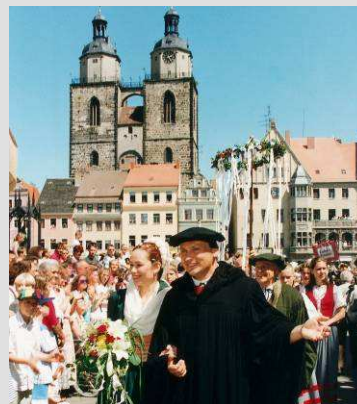
Reenactment of Luther's wedding

Wittenberg – It is best known as the place where Luther did most of his work, and you will feel his presence everywhere. Luther launched the Reformation in Wittenberg, an act of the greatest importance in Europe. Visit the All Saints Castle Church on whose door Luther hung his 96 theses in 1517, and where Luther and Melancthon are buried.