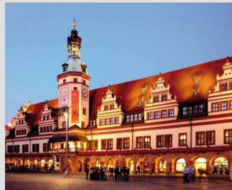
Old Town Hall

Leipzig – The city of Leipzig has been an important influence in European commercial and intellectual life for centuries, and its sights are all part of the Leipzig experience. Historical shopping arcades, lovingly restored, are typical of the architecture in the city centre. Johann Sebastian Bach was choirmaster in St. Thomas's Church, and many other composers spent time in Leipzig: Richard Wagner, Robert Schumann, Mendelssohn-Bartoldy, and the world famous St. Thomas Choir. Today many new artists live in Leipzig where a peaceful demonstration led to the reunification of Germany. In 1519, Luther visited the city and took part in an academic debate – it was here that Luther went from being a critic of the Catholic Church, to a resolute "reformer."