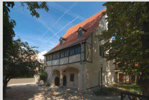
Luther's Birth House

Eisleben – the city is famous as the hometown of Martin Luther, the official name is Lutherstadt Eisleben. Luther was born here in 1483 and also died here in 1546. The city is divided into old and new towns, the latter of which was created for miners in the 14th century. Eisleben has a sizeable Old Town which dates to the 10th century and is dotted with historic churches, some of which were visited by Luther.