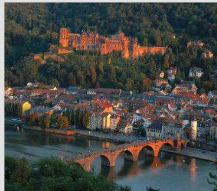
Old Neckar Bridge and Heidelberg Castle

Heidelberg – Every year, millions of visitors from all over the world are inspired by Heidelberg, this youthful German town that is steeped in history. Science and learning have also played their own distinctive part in the history of Germany's oldest university town. Heidelberg is widely regarded as one of the best business locations in Germany, while the world-famous Heidelberg Castle still towers above the lanes and the picturesque jumble of roofs of the old town. The architecture contains elements of the Gothic and Renaissance periods. The castle gardens, the Great Vat (the world's largest wine barrel) and the remarkable Pharmacy Museum are also worth a visit. Luther's early influence on Heidelberg is commemorated with the 1883 planted Luther Oak.