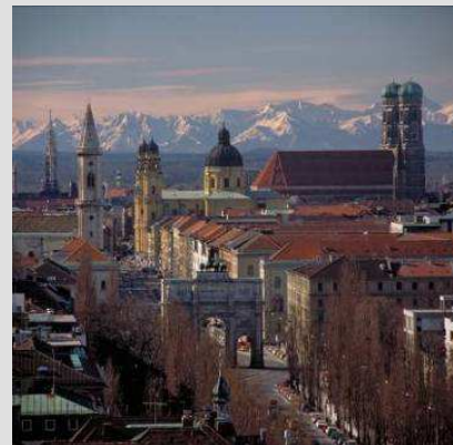
Aerial view of Munich

Munich – The capital of Bavaria has a lot of attractions to offer for all ages and tastes. Whether one is interested in history, architecture or art; whether visitors enjoy strolling through the parks, fancy attractions like a trip to the Bavaria Film Studios or long for a visit to one of Munich’s famous traditional beer gardens, they will always find something exciting in this multi-faceted city. Munich is also home to the world famous Oktoberfest which attracts millions of visitors from all over the world each year. As a center for business, industry and glamour, Munich is far more important than it was before the war. Similarly, Munich’s Jewish community, though a fraction of what it was prior to the Nazis, is much more prominent within the totality of modern German Jewry than it was prior to 1933. The Jewish Center is the heart of 21 st century Jewish Munich. It houses Munich’s main Synagogue, several Jewish organizations, and the Jewish Museum. Nothing remains of Munich’s medieval Jewish presence: the Jewish quarter in the Middle Ages was just a few steps from Marienplatz, the great central square which no visitor to Munich should miss.