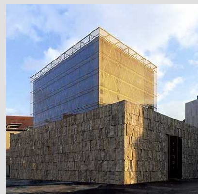
Synagogue on Jakobs Square