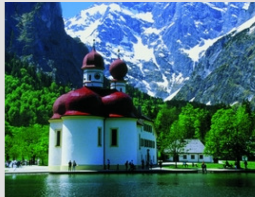
St. Bartholomew Chapel

Berchtesgaden – Located at the southeastern tip of Germany, Berchtesgaden is an area of spectacular natural beauty: majestic mountains, the crystal clear Lake Königssee (King Lake) and the unspoiled nature reserve of Berchtesgaden's Alpine National Park. It is also an area that boasts world-famous sights such as the mysterious salt mines and the Eagle's Nest (Hitler's diplomatic meeting house) on a mountain summit. The fascinating Documentation Center is one of the top highlights in the region and will provide deep insight into the significant role this region played during WWII. To relax, take a boat trip on the Königssee Lake to the 12th century chapel of St. Bartholomew, now a recognizable symbol for the Bavarian Alps. This lovely land is also dotted with charming villages where alpine customs are kept alive.