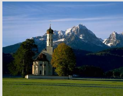
Church St. Coloman

Füssen – On the banks of the turquoise river Lech, the old town center is a maze of narrow medieval streets and magnificent baroque churches. Grouped around it are the villages of Bad Faulenbach, Hopfen am See and Weissensee, all set in idyllic Lakeland scenery amid the foothills of the Alps. Füssen is Bavaria's town at the highest elevation, and the ideal starting point for visiting the royal castles of Neuschwanstein and Hohenschwangau.