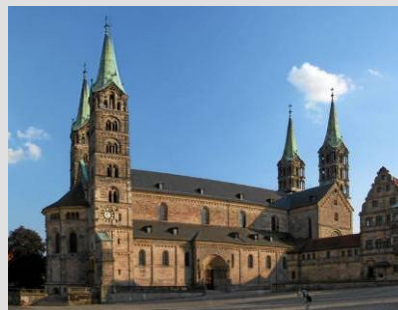
St. Peter and George Cathedral

Bamberg – From the 10th century onwards, this town became an important link with the Slav peoples, especially those of Poland and Pomerania. During its period of greatest prosperity, from the 12th century onwards, the architecture of Bamberg strongly influenced northern Germany and Hungary. In the late 18th century it was the centre of the Enlightenment in southern Germany, with eminent philosophers and writers such as Hegel and Hoffmann living there. Bamberg's nicknames - the "Seven Hill City" or "Franconian Rome" - refer to the part situated on the hills. Cathedral Hill was the spiritual and secular centre of power in the diocese of Bamberg from the 11th century until 1802. This is where some of the UNESCO town's best-known and prominent buildings are located, including the Imperial Cathedral, the baroque New Residence, the Old Court and the St. Michael Monastery. Altenburg Castle which towers above the city, the greenery of the hills and the church spires, which can be spotted from afar, are all typical landmarks.