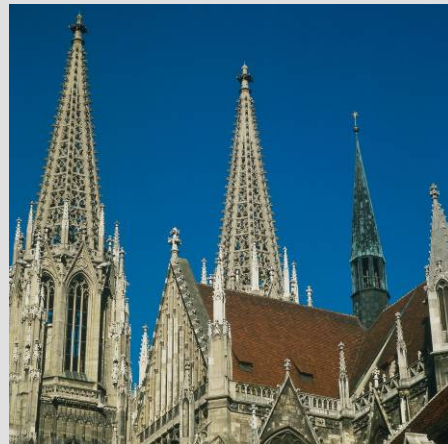
Towers of St. Peter Cathedral