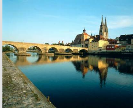
The Stone Bridge

Regensburg – home to 2000 years of living history. Some of Europe's most important architectural and cultural monuments, plus fascinating museums and art collections make this an attractive place to spend some time. Situated on the banks of the Danube, Regensburg is the ideal base for boat trips along the river. The medieval town contains many buildings of exceptional quality that testify to its history as a trading centre and to its influence on the region from the 9th century. A notable number of historic structures span some two millennia and include ancient Roman, Romanesque and Gothic buildings. Regensburg's 11th- to 13th-century architecture – including the market, city hall and cathedral – still defines the character of the town marked by tall buildings, dark and narrow lanes, and strong fortifications. The buildings include medieval patrician houses and towers, a large number of churches and monastic ensembles as well as the 12th-century Old Bridge. The town is also remarkable for the vestiges testifying to its rich history as one of the centers of the Holy Roman Empire that turned to Protestantism.