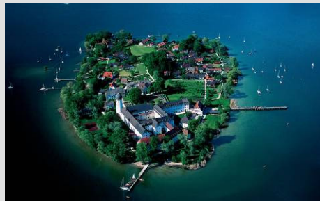
Aerial view of Fraueninsel Island

Prien by the Chiemsee Lake – Prien is a quaint town situated in a lush green valley between the Chiemgau Alps and the shores of Lake Chiemsee (Bavaria's largest lake). Lovers of sports, leisure and cultural activities alike will delight in this attractive town with its flowers and fine examples of Rococo and Baroque art. The nearby Herrenchiemsee Palace, King Ludwig's most lavish and expensive castle, is located on Herrenchiemsee island ("men's island") in the middle of the Lake. The other island in the lake is called Fraueninsel ("women's island"). This island is home to a local population of 200 people, such as artists, craftspeople, fishermen, as well as a fully operational Benedictine Abbey which was founded in 782 AD and is famous for the Cloister Liquor spirit and marzipan which are produced here by the nuns.