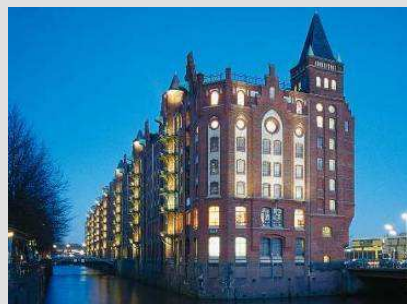
Warehouse district in the harbor