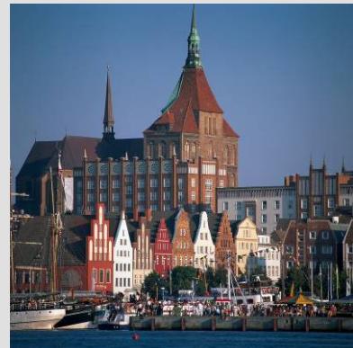
Old Town and St. Mary's Cathedral

Rostock – This almost 800 year old Hanseatic town has retained much of its original charm and today, together with the seaside resort of Warnemünde, is a vibrant university and port town. Its historical centre has the typical north German brick architecture and a tangible maritime atmosphere. Gothic, Renaissance and baroque gabled houses are impressive reminders of the wealth enjoyed by Rostock's merchants in the Middle Ages, as are the mighty churches. The astronomical clock draws visitors into the Gothic basilica St. Mary's. Close by is the town hall with its baroque frontage, and from the tower of St. Peter's there is a good view of the old quarter and the town harbor. The Cultural History Museum in Holy Cross Abbey houses medieval art such as the altar of the three kings as well as arts and crafts. Rostock's Maritime Museum is located on an old merchant ship in the IGA Park.