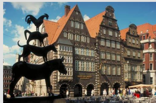
Market Square with Town Musicians Statue

Bremen – Bremen, home to the world famous Town Musicians, puts itself on the map as the pulsating, multifaceted heart of North West Germany. The 1,200 year old Hanseatic city has a unique quality that ensures a metropolitan city experience like no other – from rejuvenated Schlachte Promenade on the River Weser and the full-sized Columbus Space Module of the International Space Station to world beating attractions like the Universum Science Center Bremen. The Town Hall and the statue of Roland on the marketplace, both UNESCO sites, are outstanding representations of civic autonomy and sovereignty, as these developed in the Holy Roman Empire in Europe. The old town hall was built in the Gothic style in the early 15th century, after Bremen joined the Hanseatic League. The building was renovated in the so-called Weser Renaissance style in the early 17th century. The Roland statue stands 18 feet tall and dates back to 1404.