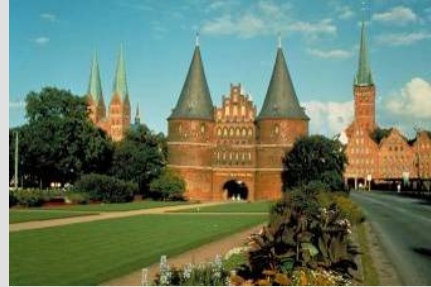
The Holstentor with St Marien and St. Petri Church

Lübeck – The former capital and Queen City of the Hanseatic League was founded in the 12th century and prospered until the 16th century as the major trading centre for northern Europe. Despite the damage it suffered during the Second World War, the basic structure of the old city, consisting mainly of 15th- and 16th-century patrician residences, public monuments (the famous Holstentor brick gate), churches and salt storehouses, remains unaltered. The Old Quarter, ringed by water, is an impressive illustration of medieval brick Gothic architecture and brings 1,000 years of history to life. The entire oval old town - the setting for Thomas Mann's novel "Buddenbrooks" - is a UNESCO world heritage site. Lübeck has remained a centre for maritime commerce to this day, and, via the coastal resort of Travemünde, a terminal for ferries to Scandinavia and the Baltic.