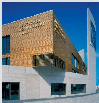
German Emigration Museum