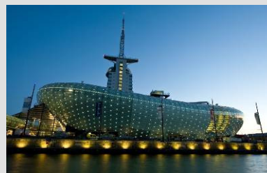
Climate House Science Center

Bremerhaven – A maritime feel and fresh sea air make a visit to Bremerhaven a breeze. The Schaufenster Fischereihafen, the fishing port tourist centre, nets many visitors who enjoy shopping and sampling gourmet food, and also boasts a wide range of other entertainments opportunities. The Lloyd Dockyard's visitors' centre provides a first-hand view of one of Europe's most modern ports, with container, car, and cruise liner terminals, and shipbuilders. All activities on the wharf can easily be observed from the visitor center's viewing platform. Another sight is the Simon Loschen lighthouse, the oldest working lighthouse on the North Sea coast mainland. It stands where the big paddle steamers use to come and go, entering and leaving the port to take the post between New York and Bremerhaven. Located at the original embarkation site, the Emigration Centre shows what it may have been like for people leaving their homes behind and seeking passage overseas from the port some 150 years ago.