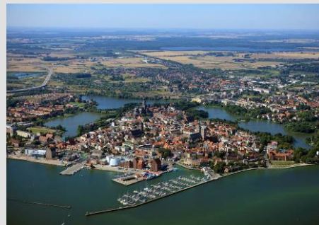
Aerial view of Stralsund