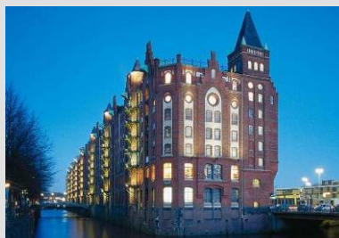
Warehouse district in the harbor