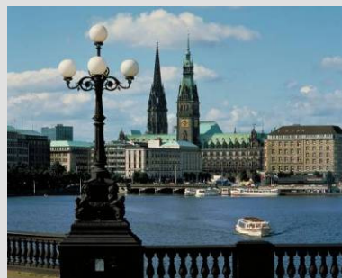
View over the Alster Lake

Hamburg – The maritime metropolis in the north is Germany's second largest city. Hamburg's role as an international center is reflected in the elegance of its merchants' villas and boulevards, the international musicals stage there, the luxurious shopping arcades, and St. Pauli – world-famous for its night-life. A touch of the exotic clings to the warehouse district in the harbor area and the city's trademark canals and bridges. With its many parks and gardens, Hamburg is also Germany's greenest city. The most beautiful views of Hamburg can be enjoyed on while on the water, for example on a boat tour on the Alster Lake (see also front page) or on the Elbe river.