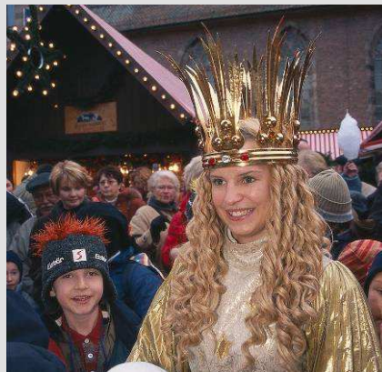
Christmas Angel at the Christmas Market

Visit to Christmas market on Hauptmarkt Square (For dates and further visitor information please check www.christkindlesmarkt.de/english )