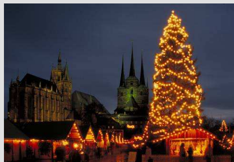
Erfurt Cathedral and St. Severus Church with Christmas tree (see also frontpage)

Erfurt – Thuringia's largest city has one of the best-preserved medieval town centers in Germany, a delightful blend of wealthy patrician townhouses and fine half-timbered buildings. One of Erfurt's most distinctive sights is the remarkable Merchants' Bridge, the longest bridge in Europe to have houses along its entire length. Romanesque architecture enthusiasts will enjoy visiting the impressive ensemble at Cathedral Square. St Mary's Cathedral replaced the church built on this site by Bishop Boniface in 742 with its cycle of stained-glass windows (14th century) and huge "Gloriosa" bell (1497). St. Severus (1280) is a five-nave Gothic hall church which houses the sarcophagus of St Severus. The church and the cathedral are Erfurt's most famous landmarks, and during Christmas season they provide an impressive background for the city's popular Christmas market.