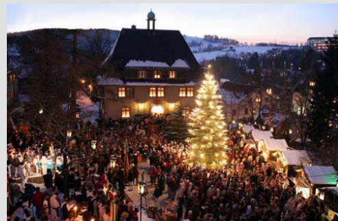
Christmas market in “toy town”

Seiffen – The “toy town” of Seiffen in the Erzgebirge mountains is known for its woodcarving tradition, and its expertise in wooden toys like nutcrackers or the “smoking man” incense smoking figurines. The local Christmas market is a great place to find unique Christmas presents, or just to have a mug of Glühwein and enjoy the snowy mountain scenery.