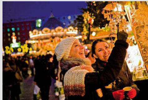
Handicrafts on Leipzig's Christmas market