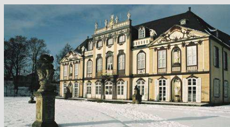
Castle Molsdorf in the snow