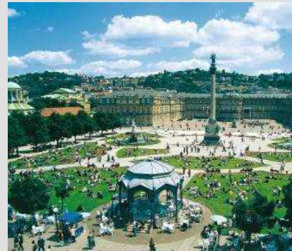
New Palace Square

Stuttgart – Charmingly situated in the heart of one of Germany's largest wine-growing regions, this vibrant metropolis fascinates visitors from all over the world. The state capital of Baden-Württemberg delights tourists not only by virtue of its magnificent panorama, its impressive gardens and parks, its fine squares, splendid palaces and buildings in a wide range of architectural styles, but also by its cultural diversity. Visit the medieval Old Palace - with its cloistered courtyard, the palace reflects the splendor of the former ducal town. Just around the corner, the magnificent baroque building of the New Palace and the Schlossplatz square are in the heart of the city and popular meeting places. Also a big draw for visitors is the sensational Mercedes-Benz World as well as the Porsche-Museum. For four weeks in the run-up to Christmas, Stuttgart is transformed into a magical winter wonderland. More than 250 stallholders offer seasonal wares, while concerts in the courtyard of the Old Palace set the festive tone. Amid the enchanting ambience, people from all over the world enjoy the city's famous Black Forest fruit loaf washed down with a mug of hot Glühwein.