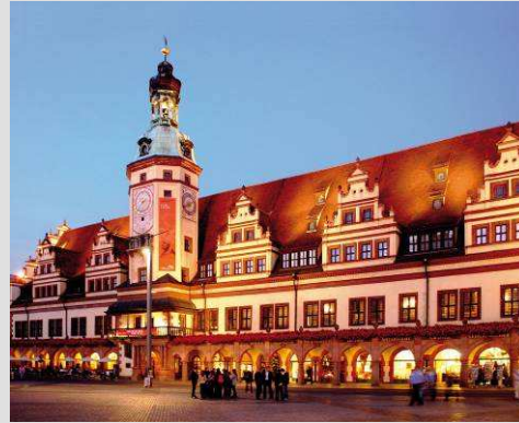
Old City Hall

Leipzig – The city of Leipzig has been an important influence in European commercial and intellectual life for centuries, and its sights are all part of the Leipzig experience. Johann Sebastian Bach was choirmaster in St. Thomas's Church, and many other composers spent time in Leipzig: Richard Wagner, Robert Schumann, Mendelssohn-Bartoldy, and the world famous St. Thomas Choir. Today many new artists live in Leipzig where a peaceful demonstration led to the reunification of Germany. Historical shopping arcades, livingly restored, are typical of the architecture in the city centre. There are great shops, a vibrant cultural scene and lively bars that stay open very late, all within a relatively small area. Every year during Christmas season Leipzig opens its Christmas market with over 250 booths and around 2 million visitors. Its roots can be traced back to the 15 th century.