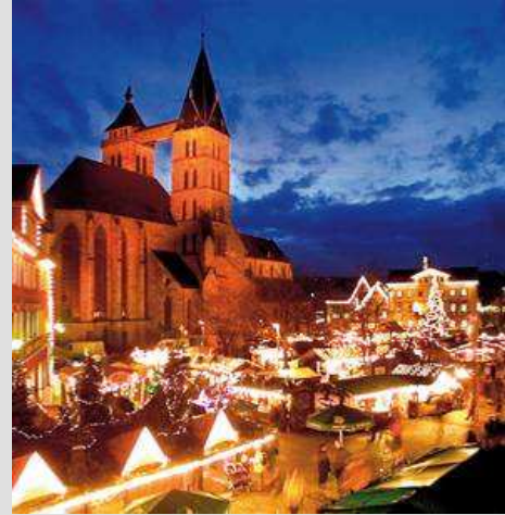
Christmas market in front of St. Dionys

Esslingen – The former Free Imperial City of Esslingen am Neckar nestles in the Neckar Valley and is surrounded by vineyards. The city looks back on a history of over 1,200 years. A stroll through the winding cobblestone alleyways and inviting pedestrian zones of the historical Old Town can be recommended not only as a shopping experience but also as a walk into the past. The medieval Old Town is the only one in the Stuttgart Region to be so well preserved. The oldest row of half-timbered houses in Germany can be admired as well as patricians' and wine-growers' houses, churches, monastic administrative centers (Pfleghöfe), gate towers and towers. Esslingen does not only welcome its winter visitors with a charming Christmas market, but also offers a medieval market at the same time with booths and performances.