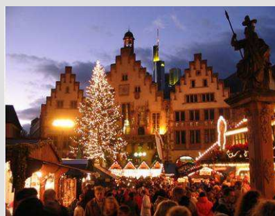
Christmas market on Römer Square

Frankfurt – As the seat of the European Central Bank and venue of more than 30 trade fairs per year, the modern city by the river Main commands center stage of the world's finance and economic markets. Frankfurt has always played an important role in European history. A number of historical buildings have remained to document this fact: the cathedral, where German kings were once crowned, St. Paul's Church, seat of the first German National Assembly, or Goethe House, birthplace of one of Germany's favorite sons. Today, Frankfurt is also recognized as a dynamic cultural center with many fine museums, theaters and galleries. Frankfurt's Christmas market on Roemer Square is one of the biggest and, with about 3 million visitors each year, one of the most popular ones in Germany.