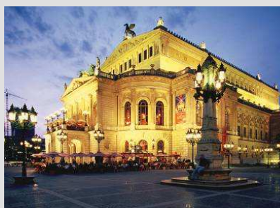
Alte Oper concert hall

Visit to local Christmas market on Römerberg, Paulsplatz and Mainkai (For dates and further visitor information please contact Frankfurt Tourist Office)