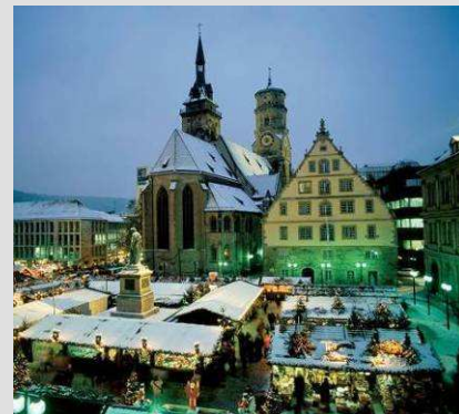
Christmas market in front of Stiftskirche Church