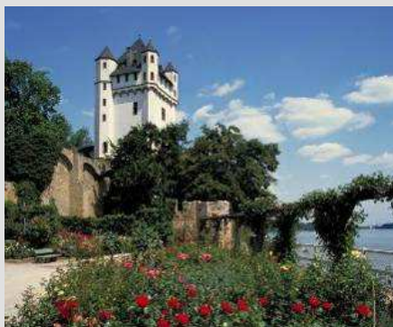
Eltville Castle by the Rhine

Eltville – a town situated right on the 'German Half-Timbered Houses Route', and famous for its wines, sparkling wines and roses. Take a guided tour of the old town centre, the Eltville Castle and the Gensfleisch Houses where Gutenberg once lived. On the fringes of the vine-clad hills of the Rheingau near Eltville is one of the most impressive examples of medieval abbey architecture: Eberbach Abbey, founded in 1136, and setting for the movie "The Name of the Rose" with Sean Connery.