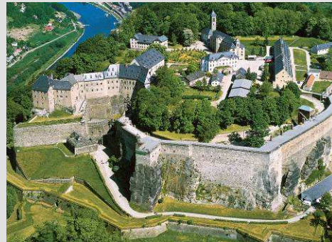
Aerial view of the fortress

Königstein Fortress – A unique monument to the art of European fortress construction. Its 750 years' history has made it an impressive configuration of late Gothic, Renaissance, Baroque and 19th century architecture. Amidst the extraordinary rock formations of the 'Saxon Switzerland' the fortress stands towering 1184 feet above sea-level on a table mountain, easily visible from afar. It is not only a magnet for people interested in military history, but also for nature-lovers, who have a fantastic view of the picturesque Elbe Sandstone Mountains and the foothills of the Osterz Mountains from the mile-and-a-half long fortified walls.