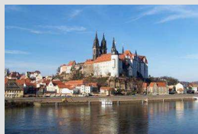
View on Albrechtsburg castle

Meissen – The Saxon town of Meissen is inextricably linked with porcelain. Before it could be made in Europe, porcelain had been imported from China since the beginning of the 13th century. In the early 18th century in the town of Meissen, research was begun to discover the keys to porcelain manufacturing. In 1708, for the first time in Europe, white porcelain was manufactured in the town of Meissen. Visit the manufacturer, where you can view historic pieces of porcelain, learn how it is created, and view the demonstration workshop to discover how Meissen pieces are individually designed and hand created. However, this charming town has many other attractions to offer including architectural highlights such as Meissen Cathedral with its characteristic towers.