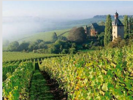
Vineyards in the Rheingau Region

Rheingau Region – The Rheingau is a long-established wine-growing region in the Mainz Basin to the right of the Rhine. It is an area of idyllic scenery where the Rhine leaves its north-south course and swings round to the west between Mainz/Wiesbaden and Rudesheim. Wine has been grown in the Rheingau since Roman times. These vineyards are particularly spectacular, and wine lovers all over the world are passionate about Riesling, preferably from a traditional Rheingau estate.