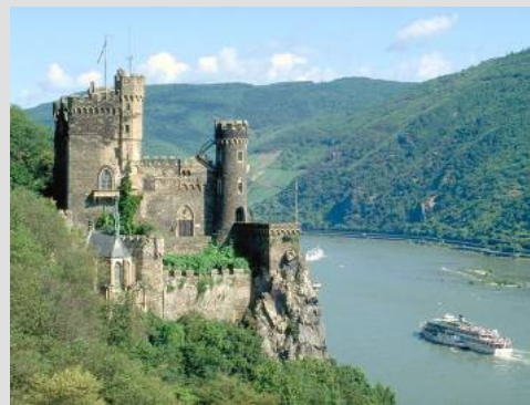
Rheinstein Castle by the Rhine

Rhine – the Romantic Rhine region has been a UNESCO World Heritage site since 2002. It is also the valley of the Lorelei, the legendary mermaid said to have lured sailors on the Rhine to their death with her beguiling song, a legend that still captivates visitors from all over the world today. The majestic river, lined with castles, palaces and medieval villages shrouded in the mystery of ancient sagas, winds its way through one of Germany's best wine-growing regions.