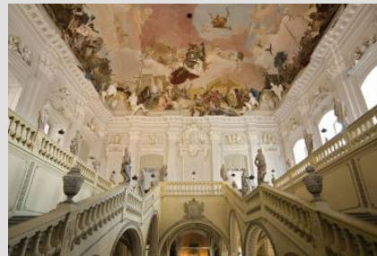
Inside the Residence Palace

Lunch at the restaurant and winery Juliusspital Weinstuben