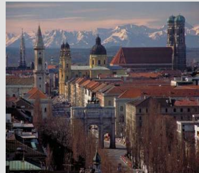
Aerial view of Munich

Munich – the capital of Bavaria has a lot of attractions to offer for all ages and tastes. Whether you are interested in history, architecture or art; whether you enjoy strolling through the parks, fancy attractions like a trip to the Bavaria Film Studios or long for a visit to one of Munich's famous traditional beer gardens, you'll always find something exciting in this multi-faceted city. Munich is also home to 46 museums, 56 theaters, 2 opera houses, and of course the world famous Oktoberfest which attracts millions of visitors from all over the world each year. For fresh fruits, vegetables and meat delicacies, or to enjoy a traditional Bavarian snack visit the charming Viktualien Market in the city center.