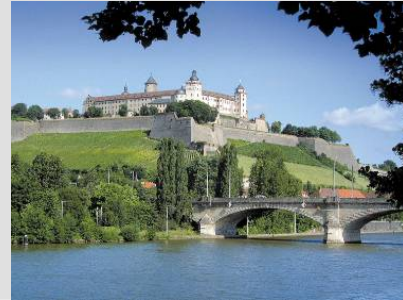
Marienberg Fortress by the Main River

Würzburg – The capital of lower Franconia is one of the loveliest baroque cities in Germany and became famous as the center of Franconian wine production. It is a popular stop among tourists traveling the Romantic Road, beautifully embedded in the valley of the Main River and is surrounded by grapevine-covered hills. Interesting places to visit include the UNESCO World Heritage Site the Residence Palace, the medieval fortress Marienberg, the historic town hall building and the Romanesque cathedral “St. Kilian.” From the old bridge “Alte Mainbrücke”, you will enjoy fantastic views of the fortress “Marienberg” and the pilgrimage church “Käppele”.