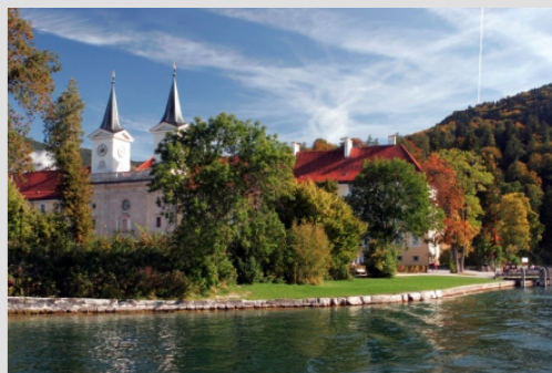
Tegernsee Abbey by the lake

Tegernsee – Artists, musicians, statesmen and nobility have lived in the fine houses that appeared in Tegernsee after the first monks settled in the valley. Visitors will note their legacy in the buildings they erected, the music and paintings from many eras of local artistic activity. The witnesses of over a thousand years of human life in the valley can be found in many commemorative plaques, in the architecture itself that spans various epochs, in the churches, chapels, castles and cloisters – such as that of the Tegernsee Abbey with its impressive frescoes by famous Hans Georg Asam.