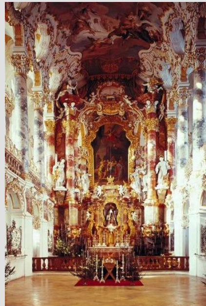
Inside the Wieskirche Church

Steingaden – A beautiful little town in the Bavarian Pfaffenwinkel region. Its Wieskirche Pilgrimage Church, a UNESCO world heritage site, is an unparalleled example of how light can be used as a building element alongside brick and stone. True pilgrims leave their cars in Steingaden and climb the shady path on foot, a walk that takes around an hour. The Church is sumptuously decorated and dedicated to the "Scourged Saviour". It is regarded as one of the most beautiful rococo churches in southern Germany. Between 1745 and 1754, Dominikus Zimmermann enlisted the help of a number of leading artists of the time to create this undisputed highlight of Bavarian rococo architecture. With its opulent stucco ornamentation and the ceiling fresco it is a masterpiece of human creativity.