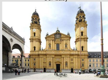
St. Kajetan Church