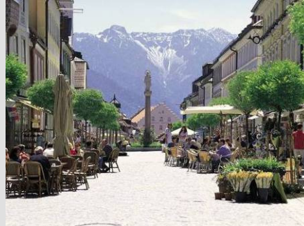
In the town of Murnau

Murnau – Nature, art and culture form a special bond in Murnau. Situated at the foothills of the Bavarian Alps, this charming climatic health resort overlooks Lake Staffelsee with its seven islands and the Nature Reserve ‘Murnauer Moos’. The spectacular landscape attracted world famous painters like Kandinsky, today remembered in two local museums. Murnau is famous for being the home of Expressionist painting. It is known as ‘the blue land’ because of the atmospheric quality of its light.