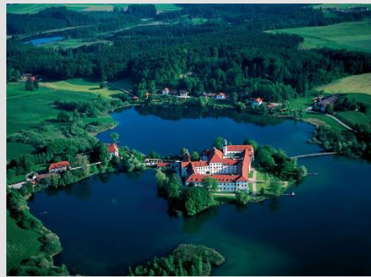
Former Seeon Monastery

Seeon – This former Benedictine Abbey (from 999 to 1803) with a thousand-year history is located on an idyllic peninsular on Lake Seeon, around 6 miles north of Lake Chiemsee. Century-old spiritual traditions are continued here but with a slightly modern twist. And although there is no longer a community of monks living here, the Benedictine rules still serve as guidelines for the modern management of the abbey.