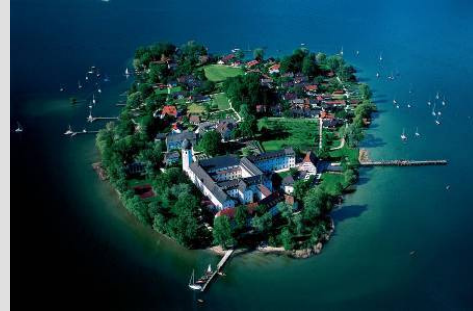
Aerial view of Fraueninsel Island

Prien by the Chiemsee Lake – Prien is a quaint town situated in a lush green valley between the Chiemgau Alps and the shores of Lake Chiemsee (Bavaria's largest lake). Lovers of sports, leisure and cultural activities alike will delight in this attractive town with its flowers and fine examples of Rococo and Baroque art. The nearby Herrenchiemsee Palace, King Ludwig's most lavish and expensive castle, is located on Herrenchiemsee island ("men's island") in the middle of the Lake. The other island in the lake is called Fraueninsel ("women's island"). This island is home to a local population of 200 people, such as artists, craftspeople, fishermen, as well as a fully operational Benedictine Abbey which was founded in 782 AD and is famous for the Cloister Liquor spirit and marzipan which are produced here by the nuns.