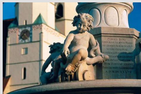
St. Mary’s fountain