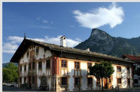
House with Lüftlmalerei paintings

Transfer to Steingaden – 16 miles (by car or coach)