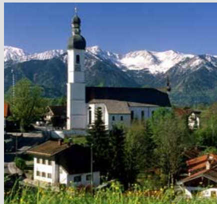
Parish Church St. Andreas

Fischbachau – Fischbachau is nestled in the wide valley of the river Leitzach, amidst gorgeous nature and framed by magnificent mountains. Visit the St. Martin Minster, the best-preserved Romanesque basilica of southern Bavaria with baroque stucco linked to the famous Wessobrunn Abbey School for craftsmen. A highlight of the rococo period is the pilgrimage chapel in Birkenstein. Visitors will be enchanted by the splendor of the golden decorated interior of the Lady chapel. The baroque parish church St. Andreas with its towering bulbous spire is another must see.