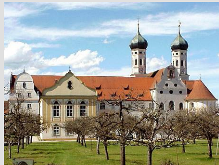
Benediktbeuern Monastery with Basilica St. Benedikt

Benediktbeuern – The founding of the Monastery goes back to 739 and was assisted by St. Bonifatius. It is one of the oldest Benedictine Monasteries in Bavaria. The Monastery went through an extended period of prosperity and wealth. Education, arts, science and the cultivation of crops was developed. From 1669 onwards, the Monastery Estate was built in baroque style. The Economy Building (“Maierhof”) was one of the most impressive agricultural buildings of the baroque decade. Secularization in 1803 set an end to the beneficial work of the Benedictines, and the Monastery became secular-private property.