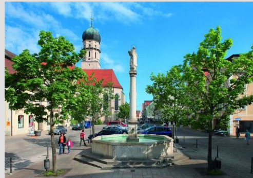
In the center of Schongau

Schongau – Located in the Lech Valley with its unforgettable scenery, the picturesque little town of Schongau still remains partly surrounded by city walls. Along the Marienplatz in the upper town, visit the Gothic Ballenhaus, an old warehouse dating back to 1515. Visitors of the Baroque Parish Church will appreciate the stucco décor of the Wessobrunn School and ceiling paintings by Matthäus Günther.