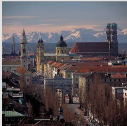
Aerial view of Munich with Church of Our Lady

Munich – the capital of Bavaria has a lot of attractions to offer for all ages and tastes. Whether you are interested in history, architecture or art; whether you enjoy strolling through the parks, fancy attractions like a trip to the Bavaria Film Studios or long for a visit to one of Munich's famous traditional beer gardens, you will always find something exciting in this multi-faceted city. Take a romantic stroll through the old parts of the city around Marien Square, Viktualien Market and Odeon Square to see how Munich's past is still lived in the every day life, enjoy a walk along the Isar river and its beautiful embankments, or visit the magnificent Nymphenburg Palace. Munich also has some of the most famous churches in Germany. The Late Gothic Church of Our Lady, with its famous domed spires that can be seen from miles away, is one of Munich's best-known landmarks. The St. Kajetan Church, a basilica built in the Italian High Baroque style, has a gloriously ornate facade. The Asam Church was endowed and built by the Brothers Asam, pioneering artists of the Rococo period.