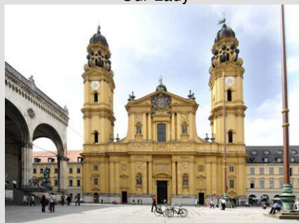
St. Kajetan Church