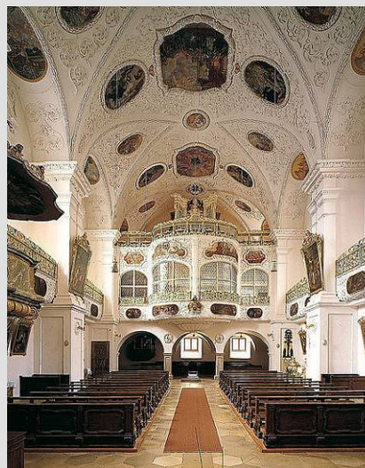
Inside St. Walburg Church

Eichstätt – 2008 saw an array of celebrations in Eichstätt to mark the city being granted a number of privileges including the right to mint coins, custom rights, market rights and city fortification privileges. A range of festivities were staged to mark the “1100th Anniversary of the City of Eichstätt”. The bestowing of such privileges on the tiny settlement on the banks of the river Altmühl enabled Eichstätt to grow and flourish into a thriving town governed by Prince Bishops, where baroque builders were given free reign to their artistic talents. The city was also to become home to the one and only Catholic university in the whole of German speaking Europe. Set in the heart of the town of Eichstätt is the baroque Benedictine abbey of St. Walburg (founded in 1035). The abbey offers travelers the opportunity to stay in one of the guesthouses and to take part in abbey life.