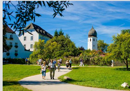
Abbey on Fraueninsel island