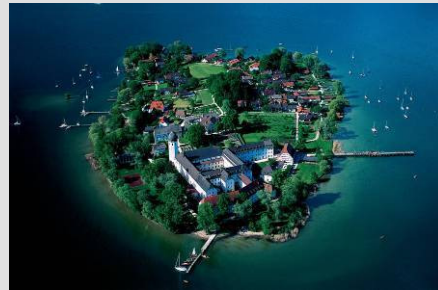
Aerial view of Fraueninsel Island

Prien by the Chiemsee Lake – Prien is a quaint town situated in a lush green valley between the Chiemgau Alps and the shores of Lake Chiemsee (Bavaria's largest lake). Lovers of sports, leisure and cultural activities alike will delight in this attractive town with its flowers and fine examples of Rococo and Baroque art. The nearby Herrenchiemsee Palace, King Ludwig's most lavish and expensive castle, is located on Herrenchiemsee island ("men's island") in the middle of the Lake. The other island in the lake is called Fraueninsel ("women's island"). This island is home to a local population of 200 people, such as artists, craftspeople, fishermen, as well as a fully operational Benedictine Abbey which was founded in 782 AD and is famous for the Cloister Liquor spirit and marzipan which are produced here by the nuns.