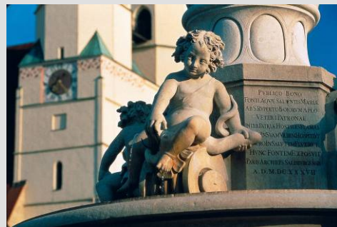
St. Mary's fountain

Transfer to Prien by the Chiemsee Lake – 38 miles (1:11)