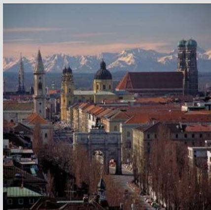
Aerial view of Munich with Church of Our Lady

Munich – the capital of Bavaria has a lot of attractions to offer for all ages and tastes. Whether you are interested in history, architecture or art; whether you enjoy strolling through the parks, fancy attractions like a trip to the Bavaria Film Studios or long for a visit to one of Munich’s famous traditional beer gardens, you will always find something exciting in this multi-faceted city. Take a romantic stroll through the old parts of the city around Marien Square, Viktualien Market and Odeon Square to see how Munich’s past is still lived in the every day life, enjoy a walk along the Isar river and its beautiful embankments, or visit the magnificent Nymphenburg Palace. Munich also has some of the most famous churches in Germany. The Late Gothic Church of Our Lady, with its famous domed spires that can be seen from miles away, is one of Munich's best-known landmarks. The St. Kajetan Church, a basilica built in the Italian High Baroque style, has a gloriously ornate facade. The Asam Church was endowed and built by the Brothers Asam, pioneering artists of the Rococo period.