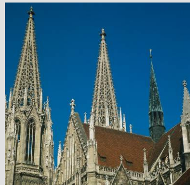
Towers of St. Peter Cathedral