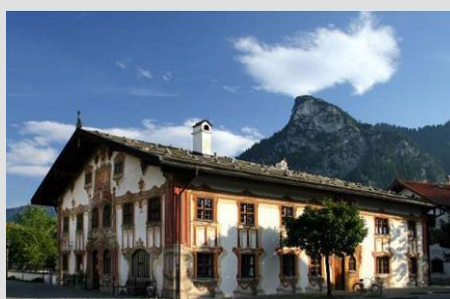
House with Lüftlmalerei paintings