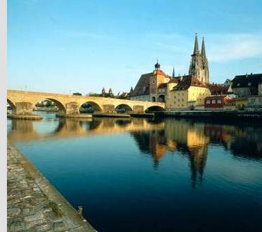
The Stone Bridge

Regensburg – home to 2000 years of living history. Some of Europe's most important architectural and cultural monuments, plus fascinating museums and art collections make this an attractive place to spend some time. Situated on the banks of the Danube, Regensburg is the ideal base for boat trips along the river. The medieval town contains many buildings of exceptional quality that testify to its history as a trading centre and to its influence on the region from the 9th century. A notable number of historic structures span some two millennia and include ancient Roman, Romanesque and Gothic buildings. Regensburg's 11th- to 13th-century architecture – including the market, city hall and cathedral – still defines the character of the town marked by tall buildings, dark and narrow lanes, and strong fortifications. The buildings include medieval patrician houses and towers, a large number of churches and monastic ensembles as well as the 12th-century Old Bridge. The cathedral is home to the famous Regensburger Domspatzen boys' choir.