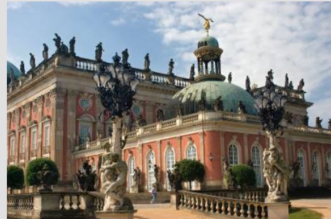
New Palace in Sanssouci Park

Potsdam – an island amidst the chain of lakes on the Havel and the beautiful wooded countryside that surrounds it. Idyllic lakes and rivers, combined with the fabulous palaces and gardens, make a visit to Potsdam and its surroundings an experience to remember (see also front page ). Berlin, the other seat of the Prussian royal family, is just next door.