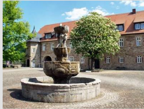
Göbels Schlosshotel “Prinz von Hessen”

Friedewald – lies on the watershed between the Fulda and the Werra, and at the foot of the Dreienberg, which is among the northernmost outliers of the Rhön. Visit the ruins of the moated castle of Friedewald with four defensive towers built in the 15th century out of sandstone, and Hammundes-eiche, an abandoned village since 1312, where church walls, a village pond, the village well and the “Fat Oak” (an old village oaktree) can still be seen.