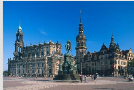
Cathedral and Royal Palace

Dresden – Unique art treasures, internationally renowned resonating bodies, and buildings of outstanding beauty – those are just a few highlights the Saxon capital has to offer. Tradition and modern spirit are equal components of Dresden's cultural flair. There are also charming landscapes alongside the Elbe river with cast meadows, exclusive residential areas and magnificent castles. The great enthusiasm for the resurrected Church of our Lady is still unbowed. Another highlight was the reopening of the Historic Green Vault in 2006. This marks the return of the famous collection of the Princes of Wettin, one of Europe's richest treasuries, to the Royal Palace of Dresden, its historical place of origin.