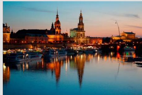
Sunset by the Elbe river

Transfer to Pillnitz – 9 miles (by car or coach)