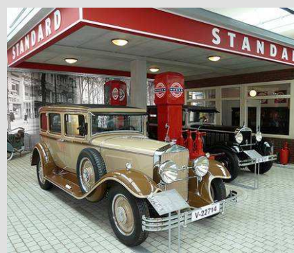
Historic gas station at the August Horch Museum

Zwickau – In the foothills of the Erzgebirge mountains, Zwickau's lovingly restored town centre has many fine places of interest, dating back through various centuries. Highlights include the town hall, the priests' houses and the Cathedral of St. Mary. Music lovers meanwhile can find out all about the life and works of the composer Robert Schumann in the house where he was born. Motoring enthusiasts should head for the August Horch Museum. Zwickau's automotive heritage began with Horch, founder of Audi, and continued with the Trabant, the typical GDR car. The museum is housed in the old Audi factory.