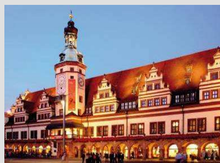
Old Town Hall

Leipzig – The city of Leipzig has been an important influence in European commercial and intellectual life for centuries, and its sights are all part of the Leipzig experience. Johann Sebastian Bach was choirmaster in St. Thomas's Church, and many other composers spent time in Leipzig: Richard Wagner, Robert Schumann, Mendelssohn-Bartoldy, and the world famous St. Thomas Choir. Today many new artists live in Leipzig where a peaceful demonstration led to the reunification of Germany. Historical shopping arcades, lovingly restored, are typical of the architecture in the city centre. There are great shops, a vibrant cultural scene and lively bars that stay open very late, all within a relatively small area. In 2005, BMW opened a new plant, mainly for the BMW 1.