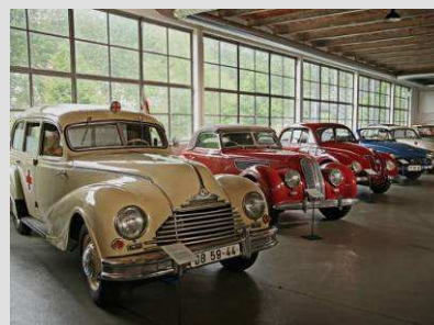
Automobile World Eisenach