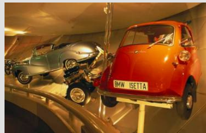
Car display at the BMW Museum