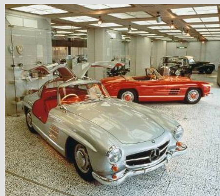
Mercedes Benz Museum