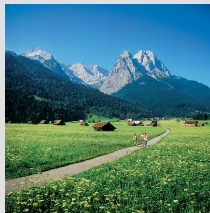
The mountains Waxenstein, Zugspitze and Alpspitze

Garmisch-Partenkirchen – Germany's largest alpine resort offers double the experience, and not just because it consists of two towns that were merged for the 1936 Olympic Winter Games. Rather, it's because Garmisch-Partenkirchen is both a world-class ski resort and a summer vacation playground. It is also one of the most notable climatic health resorts in the Bavarian Alps. It is at an altitude of 2,362 feet high and is the festival site and former home town of Richard Strauss. The Zugspitze, Germany's highest peak, is located here and culminates at an impressive 9,842 feet high.