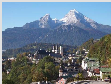
Aerial view of Berchtesgaden

Berchtesgaden – Located at the southeastern tip of Germany, Berchtesgaden is an area of spectacular natural beauty: majestic mountains, the crystal clear Lake Königssee (King Lake) and the unspoiled nature reserve of Berchtesgaden's Alpine National Park. It is also an area that boasts world-famous sights such as the mysterious salt mine and the Eagle's Nest (Hitler's diplomatic meeting house) on a mountain summit. The fascinating Documentation Center is one of the top highlights in the region and will provide deep insight into the significant role this region played during WWII.