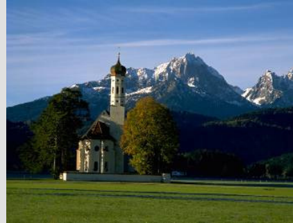
Church St. Coloman

Füssen – On the banks of the turquoise river Lech, the old town center is a maze of narrow medieval streets and magnificent baroque churches. Grouped around it are the villages of Bad Faulenbach, Hopfen am See and Weissensee, all set in idyllic Lakeland scenery amid the foothills of the Alps. Füssen is Bavaria's town at the highest elevation, and the ideal starting point for visiting the royal castles of Neuschwanstein and Hohenschwangau.