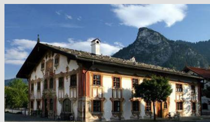
House with Lüftlmalerei paintings