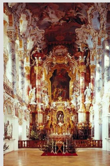
Inside the Wieskirche Church

Steingaden – A beautiful little town in the Bavarian Pfaffenwinkel region. Its Wieskirche Pilgrimage Church, a UNESCO world heritage site, is an unparalleled example of how light can be used as a building element alongside brick and stone. True pilgrims leave their cars in Steingaden and climb the shady path on foot, a walk that takes around an hour. The Church is sumptuously decorated and dedicated to the "Scourged Saviour". It is regarded as one of the most beautiful rococo churches in southern Germany. Between 1745 and 1754, Dominikus Zimmermann enlisted the help of a number of leading artists of the time to create this undisputed highlight of Bavarian rococo architecture. With its opulent stucco ornamentation and the ceiling fresco it is a masterpiece of human creativity.