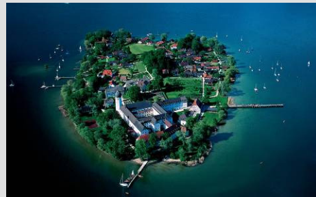
Aerial view of Fraueninsel Island

Prien by the Chiemsee Lake – Prien is a quaint town situated in a lush green valley between the Chiemgau Alps and the shores of Lake Chiemsee (Bavaria’s largest lake). Lovers of sports, leisure and cultural activities alike will delight in this attractive town with its flowers and fine examples of Rococo and Baroque art. The nearby Herrenchiemsee Palace, King Ludwig's most lavish and expensive castle, is located on Herrenchiemsee island (“men’s island”) in the middle of the Lake. The other island in the lake is called Fraueninsel (“women’s island”). This island is home to a local population of 200 people, such as artists, craftspeople, fishermen, as well as a fully operational Benedictine Abbey which was founded in 782 AD and is famous for the Cloister Liquor spirit and marzipan which are produced here by the nuns.