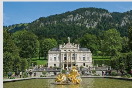
Royal Villa at Castle Linderhof