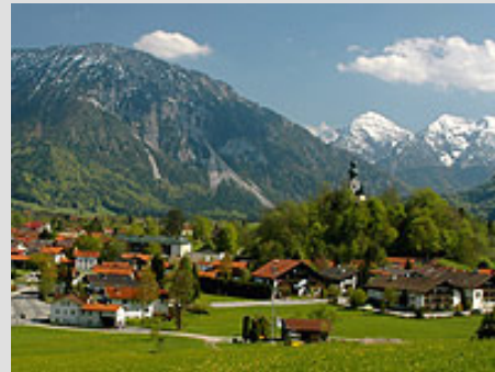
The town of Ruhpolding

Ruhpolding – Surrounded by mountains, Ruhpolding is nestled in the foothills of the Chiemgau Alps and has a relaxed, holiday atmosphere. The village has a wide range of activities to suit all tastes and walking in the surrounding meadows and mountains is a rewarding experience with endless magnificent views to admire.