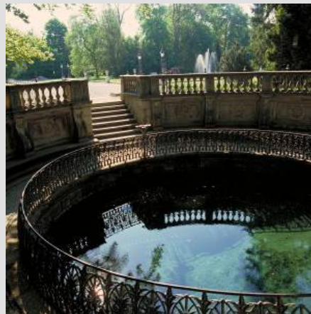
Source of the Danube

Donaueschingen – Holidaymakers who are especially appreciative of culture and nature can look forward to some unforgettable holiday experiences along the Danube (in German: 'Donau'). Visitors to the town of Donaueschingen will have the chance to see its charming art nouveau architecture as well as the river's very source in the beautiful Fürstenberg Palace Park. The young Danube between Donaueschingen to Ulm is a real wonder child and particularly suitable for cyclists and people travelling by boat.