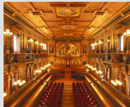
Old assembly hall at the University