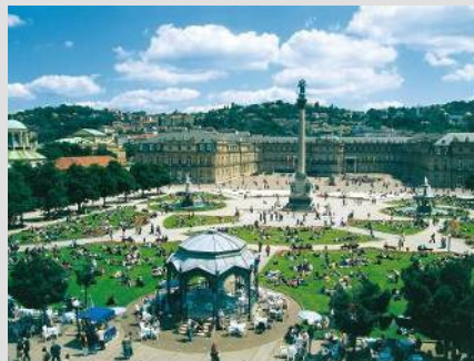
New Palace Square

Stuttgart – Charmingly situated in the heart of one of Germany's largest wine-growing regions, this vibrant metropolis fascinates visitors from all over the world. The state capital of Baden-Wuerttemberg delights tourists not only by virtue of its magnificent panorama, its impressive gardens and parks, its fine squares, splendid palaces and buildings in a wide range of architectural styles, but also by its cultural diversity. Visit the medieval Old Palace - with its cloistered courtyard, the palace reflects the splendor of the former ducal town. Just around the corner, the magnificent baroque building of the New Palace and the Schlossplatz square are in the heart of the city and popular meeting places. Also a big draw for visitors is the sensational Mercedes-Benz World as well as the Porsche-Museum.