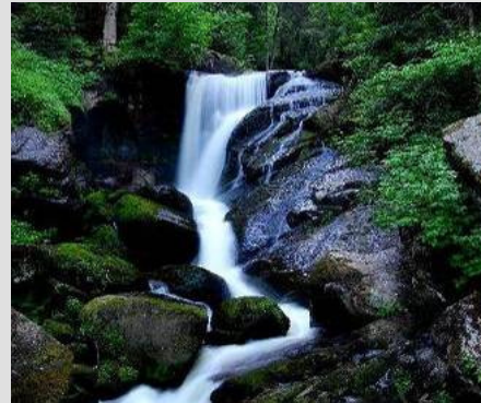
Waterfalls in the Black Forest

Triberg in the Black Forest – Deeply rooted in its traditional culture and possibly best known as the home of the cuckoo clock, the Black Forest is an area of mountains and forest 125 miles long and up to 40 miles wide, which borders France in the west and Switzerland in the south. Many luxurious spa resorts use the hot or mineral springs in the valleys for a variety of therapeutic treatments.