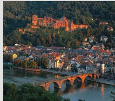
View over Heidelberg

Heidelberg – Every year, millions of visitors from all over the world are inspired by Heidelberg, this youthful German town that is steeped in history. Science and learning have also played their own distinctive part in the history of Germany's oldest university town. Heidelberg is widely regarded as one of the best business locations in Germany, while the world-famous Heidelberg Castle still towers above the lanes and the picturesque jumble of roofs of the old town. The architecture contains elements of the Gothic and Renaissance periods. The castle gardens, the Great Vat (the world's largest wine barrel) and the remarkable Pharmacy Museum are also worth a visit. Romantic and idyllic, cosmopolitan and dynamic – Heidelberg effortlessly combines the apparent opposites of myth and modernity.