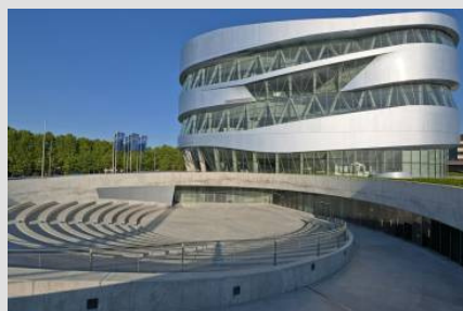
Mercedes Benz Museum