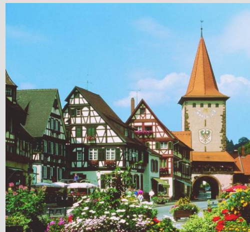
Obertor Gate and Old Quarter

Gengenbach – A tourist destination on the western edge of the Black Forest. Travelers approaching Gengenbach are greeted from afar by the church- and watchtowers that invite them into the historical town centre, where narrow alleys lead them to picturesque corners. On the market square, the stone knight on top of the fountain is a sign of the pride of the former free imperial town, just as the over 200 year-old town-hall. The impressive building and the uncountable romantic half-timbered houses dominate the image of the town. Gengenbach is also home to the World's Largest Advent Calendar House – the 24 windows of the town hall serve as the “doors” of the calendar.