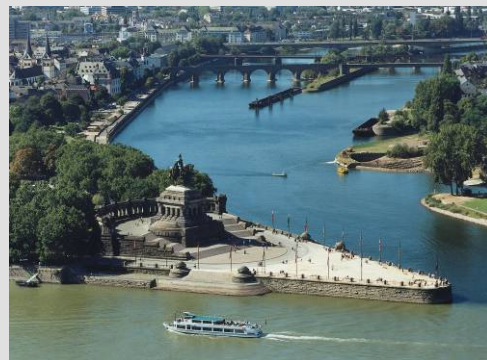
Confluence of Moselle and Rhine

Transfer to Bendorf – 8 miles (by car or coach)