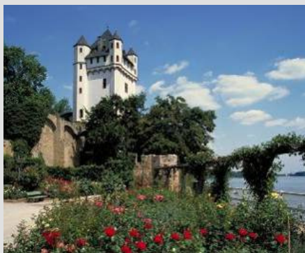
Eltville Castle by the Rhine

Eltville – a town situated right on the 'German Half-Timbered Houses Route', and famous for its wines, sparkling wines and roses. Take a guided tour of the old town centre, the Eltville Castle and the Gensfleisch Houses where Gutenberg once lived. On the fringes of the vine-clad hills of the Rheingau near Eltville is one of the most impressive examples of medieval abbey architecture: Eberbach Abbey, founded in 1136, and setting for the movie "The Name of the Rose" with Sean Connery.