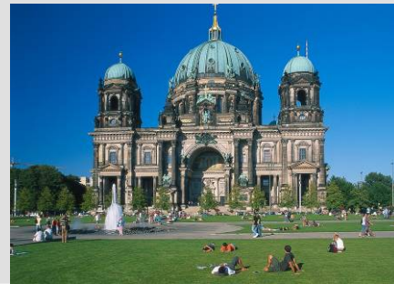
Berlin Cathedral on Museum Island

Berlin – The events of the past have left their mark on Berlin's cityscape – and the city is still changing today. "Berlin is always in the process of becoming", remarked historian Karl Scheffler, and this is one of the traits that makes it one of Europe's most vibrant, exciting and colorful capitals. One is spoilt for choice with more than 1,500 events every day as well as numerous parks, museums, operas, and historical sites such as the Brandenburg Gate or the Berlin Wall. The five museums on the Museumsinsel in Berlin (UNESCO site), built 1824-1930, are the realization of a visionary project and show the evolution of approaches to museum design over the course of the 20th century. Strolls through the modern government district provide new perspectives to modern architecture, while the elegant Kurfürstendamm promenade in the former West still attracts well-heeled shoppers from all around the world.