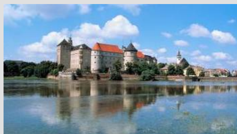
Castle and St. Mary's town church

Torgau – the City of Renaissance and Reformation. In Torgau the first Protestant church was established in 1544. Here the Torgau Articles were drawn up, and essential part of the Augsburg Confession. Martin Luther's wife is buried at the Church of St. Mary.