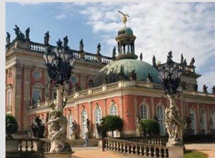
New Palace in Sanssouci Park

Potsdam – An island amidst the chain of lakes on the Havel and the beautiful wooded countryside that surrounds it. Idyllic lakes and rivers, combined with the fabulous palaces and gardens, make a visit to Potsdam an experience to remember. With 500 ha of parks and 150 buildings constructed between 1730 and 1916, Potsdam's complex of palaces and parks forms an artistic whole, whose eclectic nature reinforces its sense of uniqueness. Voltaire stayed at the Sanssouci Palace, built under Frederick II between 1745 and 1747.