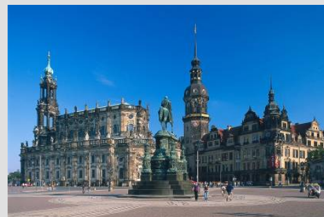
Cathedral and Royal Palace

Dresden – Unique art treasures, internationally renowned resonating bodies, buildings of outstanding beauty – those are just a few highlights the Saxon capital has to offer. Tradition and modern spirit are equal components of Dresden’s cultural flair. There are also charming landscapes alongside the Elbe river with cast meadows, exclusive residential areas and magnificent castles. The great enthusiasm for the resurrected Church of our Lady is still unbowed. Another highlight was the reopening of the Historic Green Vault in 2006. This marks the return of the famous collection of the princes of Wettin, one of Europe’s richest treasures, to the Royal Palace of Dresden, its historical place of origin.