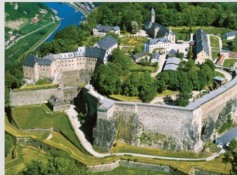
Aerial view of the fortress

Königstein Fortress – A unique monument to the art of European fortress construction. Its 750 years' history has made it an impressive configuration of late Gothic, Renaissance, Baroque and 19th century architecture. Amidst the extraordinary rock formations of the 'Saxon Switzerland' the fortress stands towering 1184 feet above sea-level on a table mountain, easily visible from afar. It is not only a magnet for people interested in military history, but also for nature-lovers, who have a fantastic view of the picturesque Elbe Sandstone Mountains and the foothills of the Osterz Mountains from the mile-and-a-half long fortified walls. On a guided tour, you will also get a chance to see the deep, 400-year-old cellars and underground casemates.