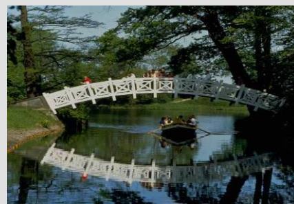
Gondola ride in Wörlitz Park

Wörlitz – The Garden Kingdom of Dessau-Wörlitz is an exceptional example of landscape design and planning of the Age of the Enlightenment, the 18th century, and has therefore been added to the UNESCO list. Its diverse components - outstanding buildings, landscaped parks and English gardens, and subtly modified expanses of agricultural land - serve aesthetic, educational, and economic purposes in an exemplary manner.