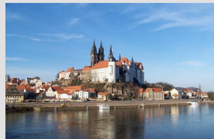
View on Albrechtsburg castle

Meissen – The Saxon town of Meissen is inextricably linked with porcelain. Before it could be made in Europe, porcelain had been imported from China since the beginning of the 13th century. In the early 18th century in the town of Meissen, research was begun to discover the keys to porcelain manufacturing. In 1708, for the first time in Europe, white porcelain was manufactured in the town of Meissen. Visit the manufacturer, where you can view historic pieces of porcelain, learn how it is created, and view the demonstration workshop to discover how Meissen pieces are individually designed and hand created. However, this charming town has many other attractions to offer including architectural highlights such as Meissen Cathedral with its characteristic towers.