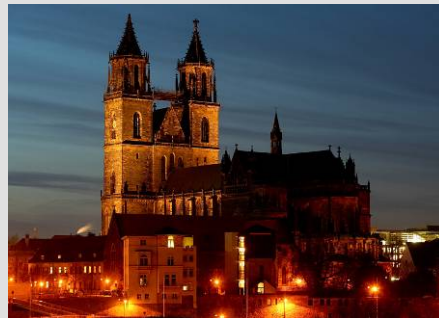
St. Mauritius Cathedral

Magdeburg – First mentioned in records in 805 and now the regional capital of Saxony-Anhalt, Magdeburg has an incredible array of monuments that serve as reminders of its turbulent history. The townscape has been shaped by Magdeburg's cultural heritage and features historical monuments as well as the massive buildings dating from the period of communist town planning. Throughout its colorful history this town on the River Elbe has been subjected to devastation and destruction and enjoyed frequent periods of prosperity, and this is still very much reflected in the current townscape. Architectural monuments dating from all the historical periods such as the imperial cathedral and Monastery of Our Lady hark back to the former glory and wealth of this former centre of imperial power.